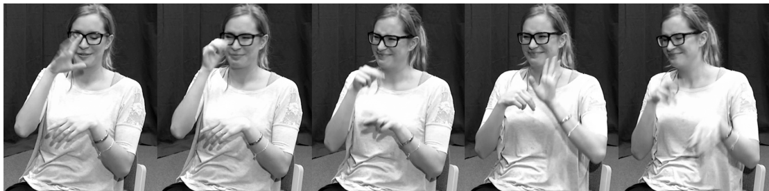
Fig. 3. Video frames showing the production of the sentence (17).

(17) In telling a story about a boy, dog, and a frog: