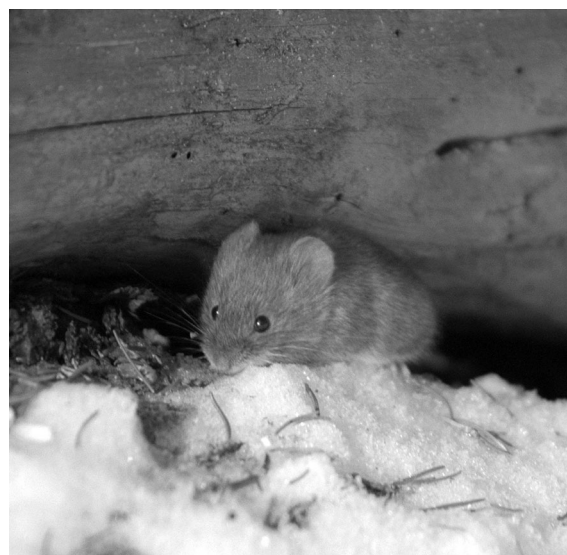
Figure 1. Study species, the bank vole Myodes glareolus is a small rodent species common in northern Europe. The main habitats are forests and fields, and the diet typically consists of forbs, shoots, seed, berries, and fungi.

We aimed to study the effects of past and present densities on the body mass, condition, and survival of young bank voles ( Myodes glareolus Schreber) (Fig. 1), by designing an experiment where individuals born in an enclosure population of 8, 12, 16, 20, or 24 adult individuals were transplanted in either a low (9–10 adult individuals) or a high (18 adult individuals) density enclosure to overwinter. We hypothesized that a change in population density would lead to a mismatch between an immediate adaptive response and future environment, and thereby to lowered individual fitness (Bateson et al. 2004). This idea parallels the concept of predictive adaptive responses (PAR) of human evolution, which states that organisms preset their physiology according to the cues of their prenatal environment in expectation that particular physiology will match their future environment (Gluckman et al. 2005). In our study, however, we cannot quan-