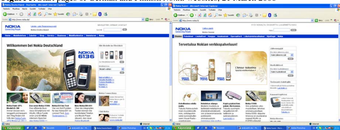
Figure 3. Start pages of German and Finnish Nokia websites, 21 March 2006

A culture specific design was found on the Chinese Nokia start page also in 2006 (see Figure 4). Again, three pictures alternated: dancing people, a disc jockey, and the silhouette of a mirror-flipped man above the symbolic Tian An Men building in Peking. The text on the first picture is “Wild dancing makes the e-sound explode.”, on the second picture “The famous DJ Jamaster A introduces the coolest music trends” and on the third picture “There is also the rhapsody ‘Tian An Men’ to download free of charge.”. Hence, this time Nokia products are introduced as guarantors for combining modern and traditional life styles. 4