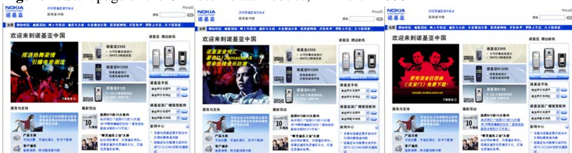
Figure 4. Start page of the Chinese Nokia website, 21 March 2006

A culture specific design was found on the Chinese Nokia start page also in 2006 (see Figure 4). Again, three pictures alternated: dancing people, a disc jockey, and the silhouette of a mirror-flipped man above the symbolic Tian An Men building in Peking. The text on the first picture is “Wild dancing makes the e-sound explode.”, on the second picture “The famous DJ Jamaster A introduces the coolest music trends” and on the third picture “There is also the rhapsody ‘Tian An Men’ to download free of charge.”. Hence, this time Nokia products are introduced as guarantors for combining modern and traditional life styles. 4