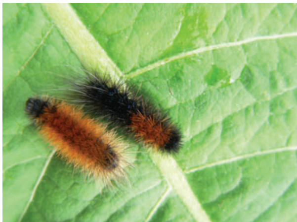
Fig. 1. Variation in the size of the orange patch and black pattern elements in aposematic Parasemia plantaginis larvae.