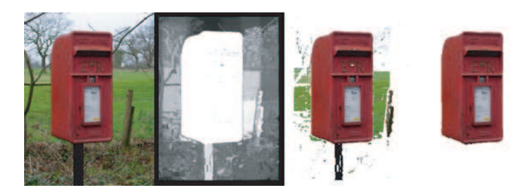
Fig. 1. Example result achieved using the proposed approach. From left to right: original image, saliency map, segmentation by thresholding, and segmentation by using the CRF model.

that the objects of interest must reside in the predefined categories from which the training samples must be available. Furthermore, the training process is rather extensive and the performance is dictated by the training data.