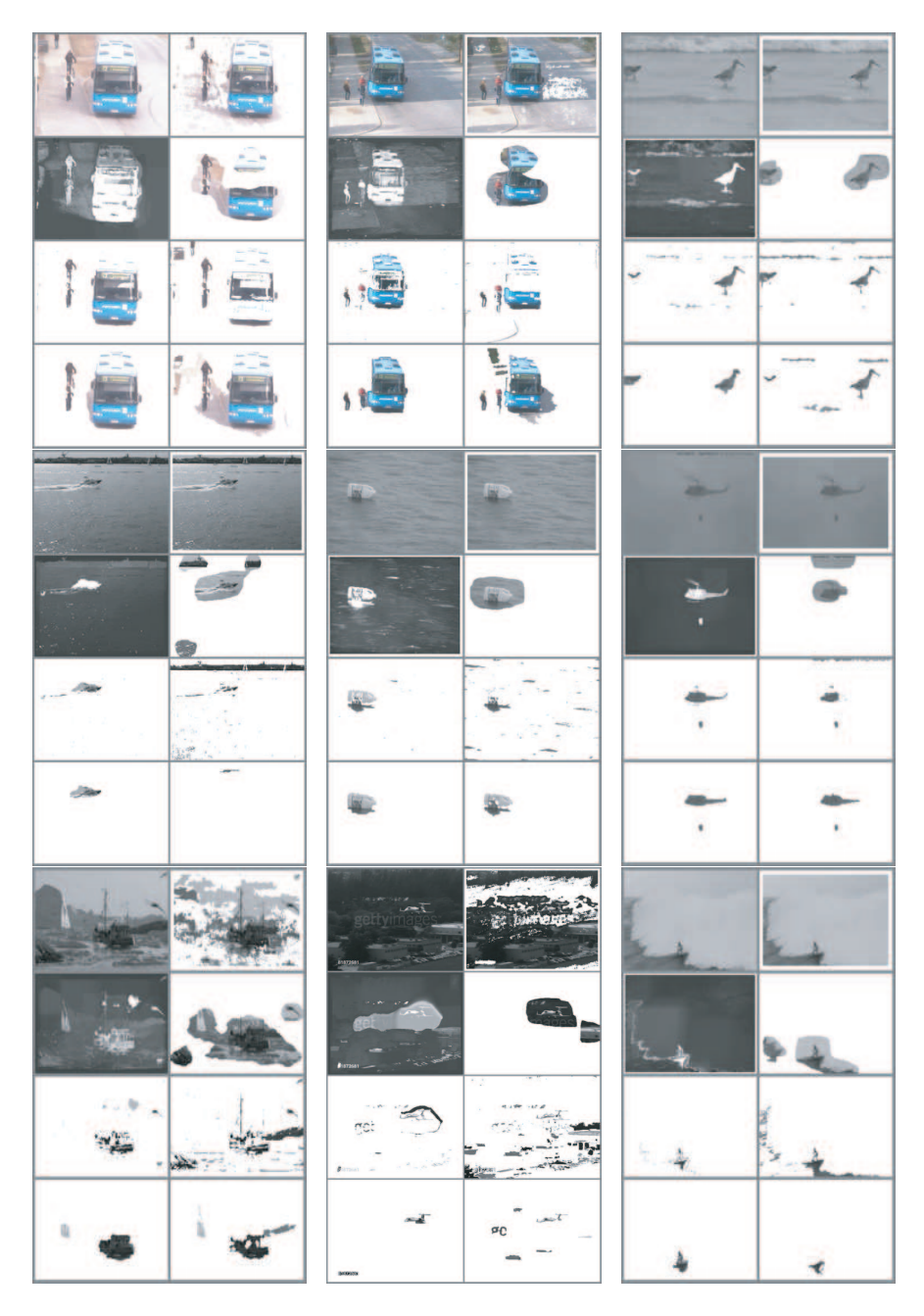
Fig. 5. Results of saliency detection from videos. Each group of eight images correspond to one test sequence and they are organized as follows: Left column from top to bottom consists of the original frame, the proposed saliency map, segmentation by thresholding proposed saliency map, and segmentation using the proposed CRF model. Right column from top to bottom consists of segmentations using the saliency maps and full post processing of comparison methods [10], [24], [20], and [21], respectively.