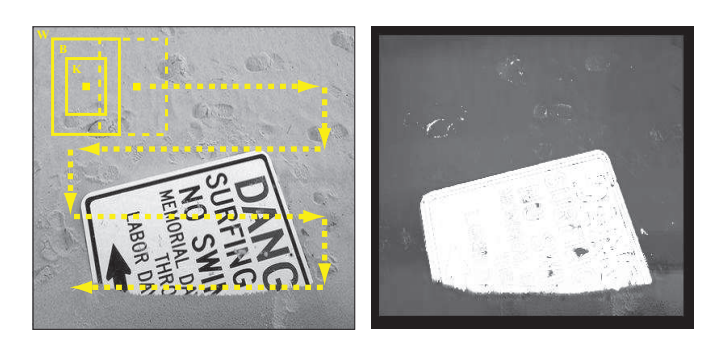
Fig. 2. Illustration of saliency map computation.

The computation of S_0(x) can be achieved through the Bayes formula P(A|B) = P(B|A)P(A)/P(B). Using the abbreviations H_0 , H_1 , and F(x) for the events Z \in K , Z \in B , and F(Z) \in Q_{F(x)} , respectively, gives that