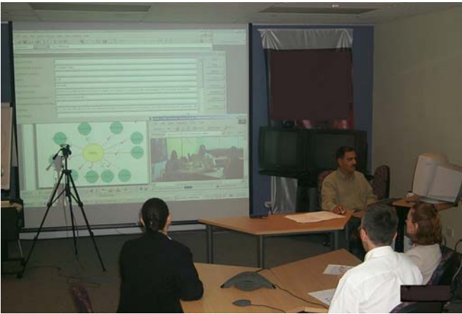
Figure 3. Rich communication media for collaborative requirements analysis

As illustrated in Figure 3, audio, video and data channels are used in the communication with the remote developers (on average two remote developers at two sites, in Australia and New Zealand). Microsoft PowerPoint is used to construct context diagrams that identify interrelationships that may exist in the system design as a result of implementing the feature , and Excel forms to capture newly developed technical requirements. NetMeeting is used to share these applications across distance.